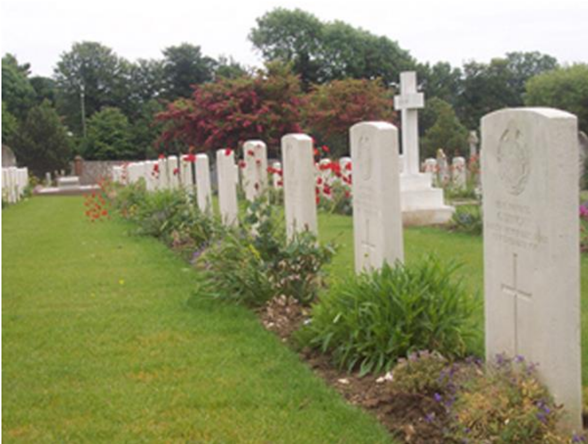
Figure 4: West Indian graves in Seaford.