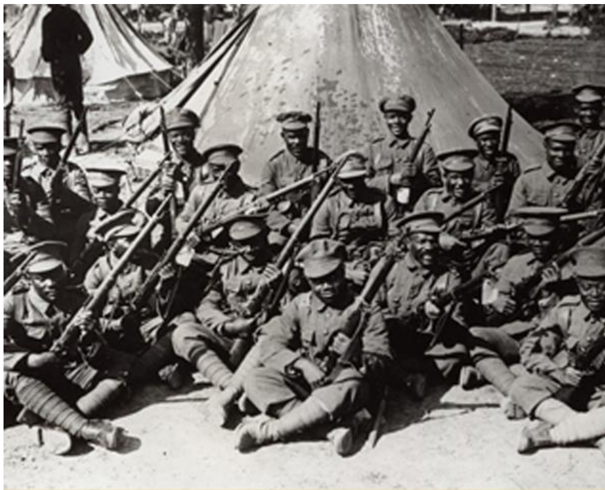
Figure 2: Men of the West Indies Regiment in a camp near the Amiens-Albert Road.