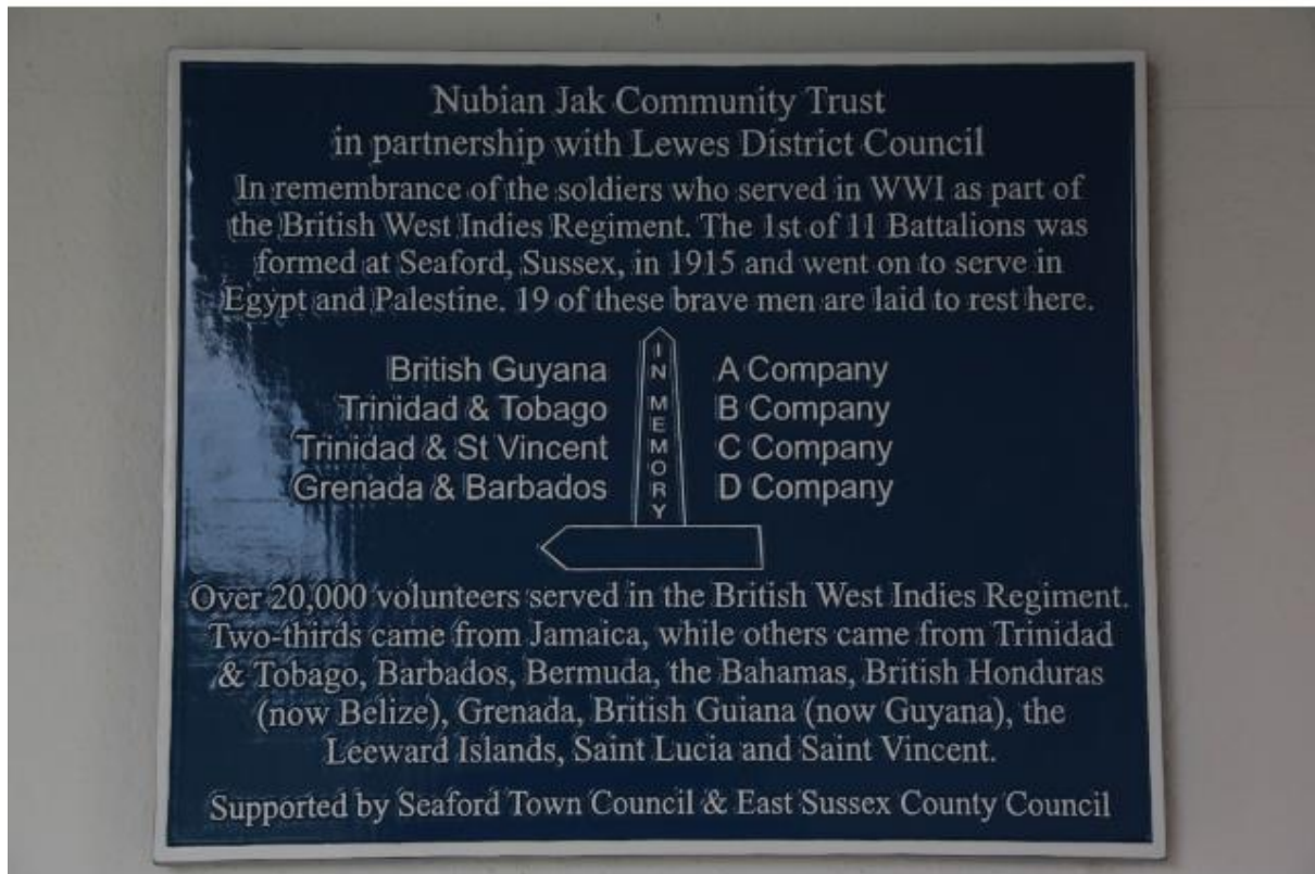
Figure 5: Memorial Blue Plaque for the West Indian Regiment in Seaford