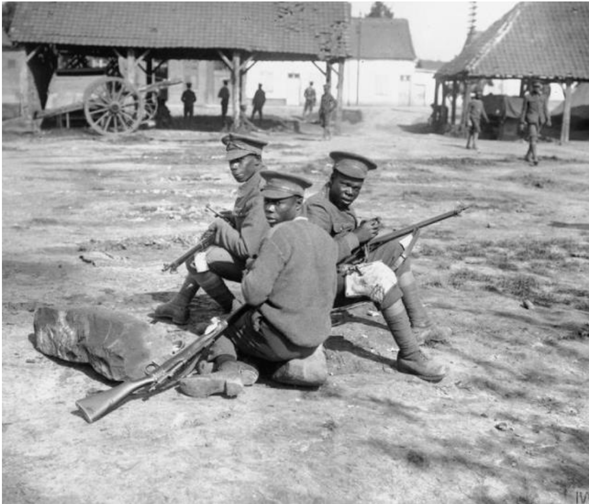
Figure 1: Men of the West Indies Regiment cleaning their rifles. Amiens-Albert Road.