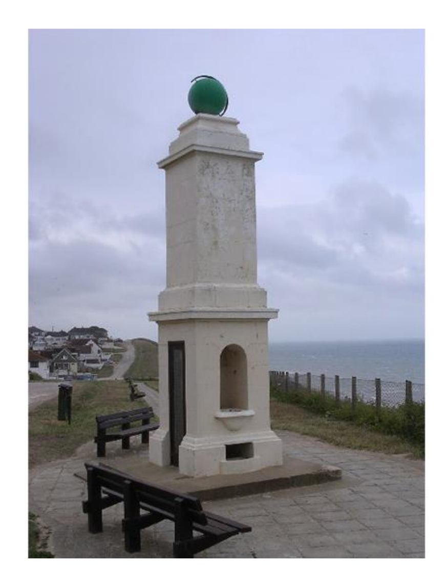
Figure 1: The Meridian Monument in Peacehaven