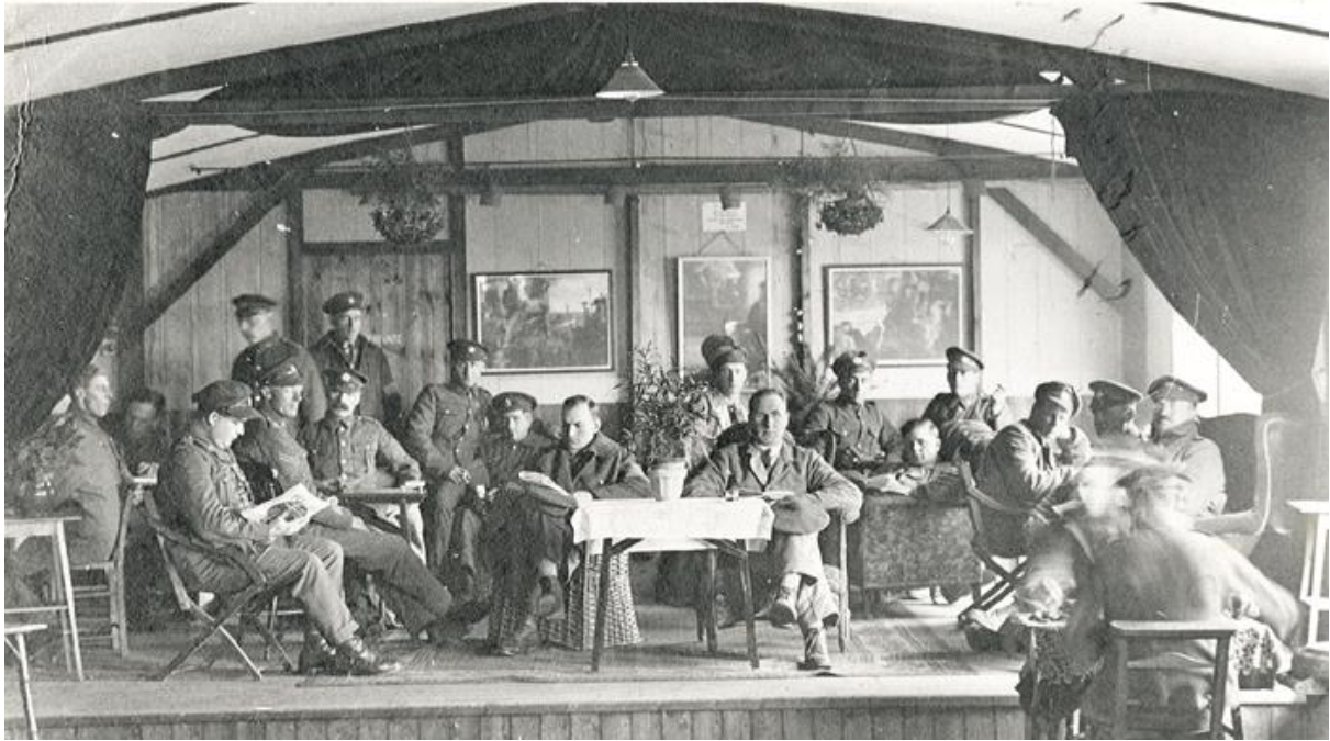
Figure 4: Cooden Camp, Catholic Army Hut c1914