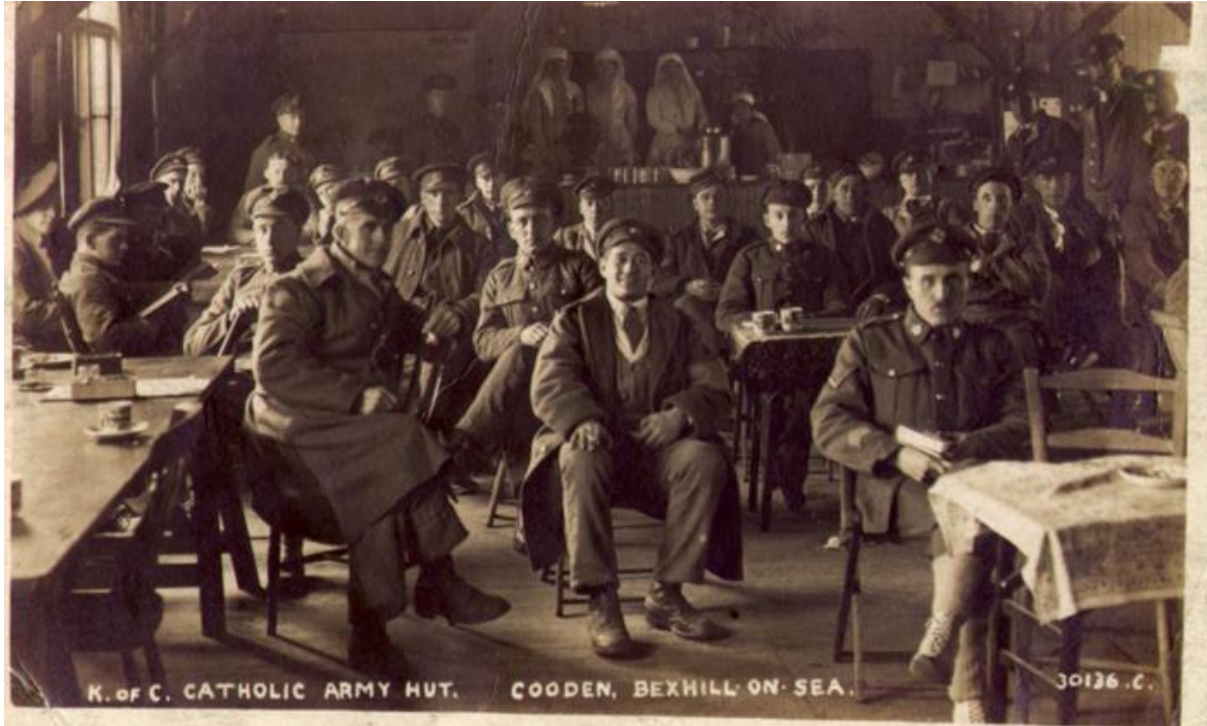
Figure 3: Cooden Camp