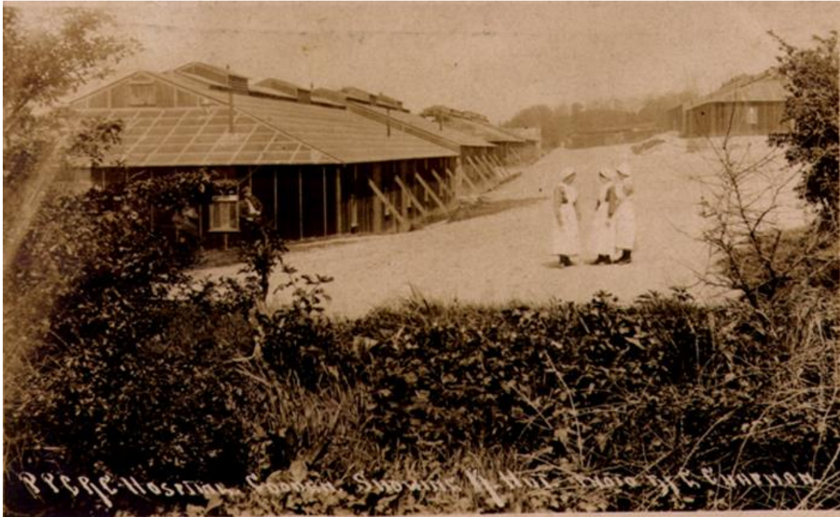
Figure 5: Cooden Camp hospital