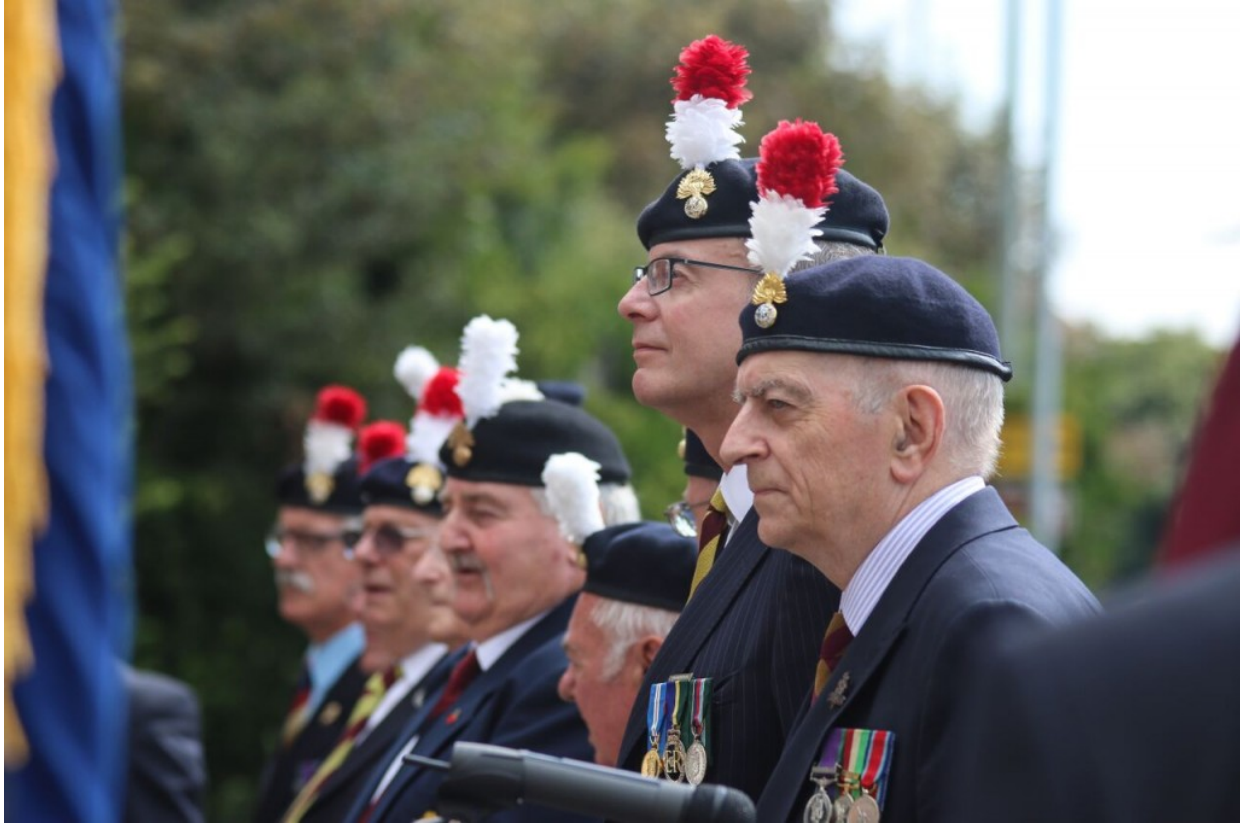
Figure 9: Cuthbert Bromley VC Paving Stone Ceremony - Seaford 16/08/2015