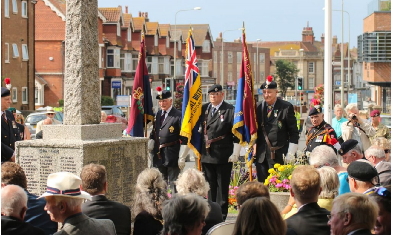
Figure 10: Cuthbert Bromley VC Paving Stone Ceremony - Seaford 16/08/2015