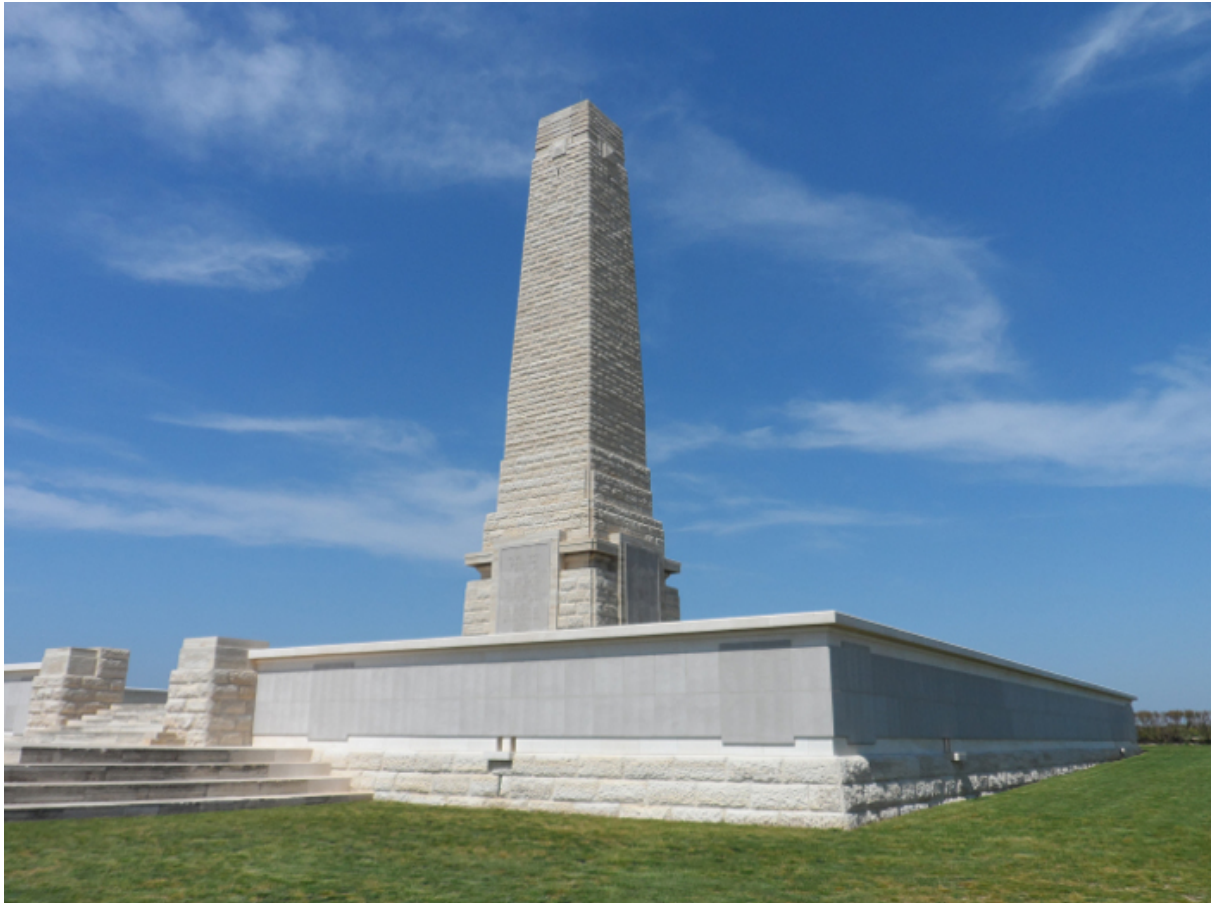
Figure 4: The Helles Memorial – © Commonwealth War Graves Commission