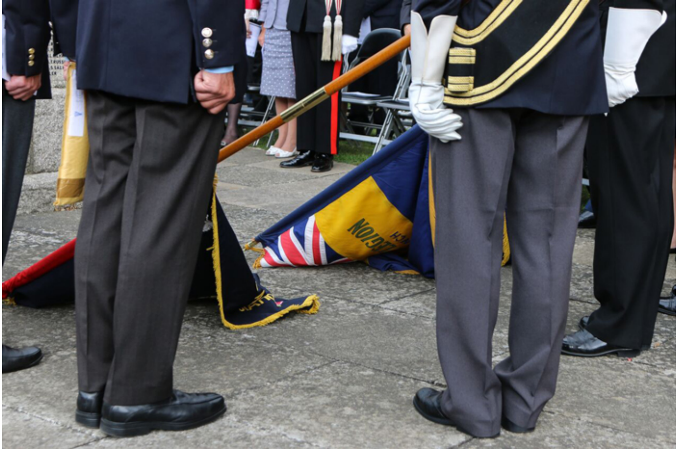
Figure 6: Cuthbert Bromley VC Paving Stone Ceremony - Seaford 16/08/2015