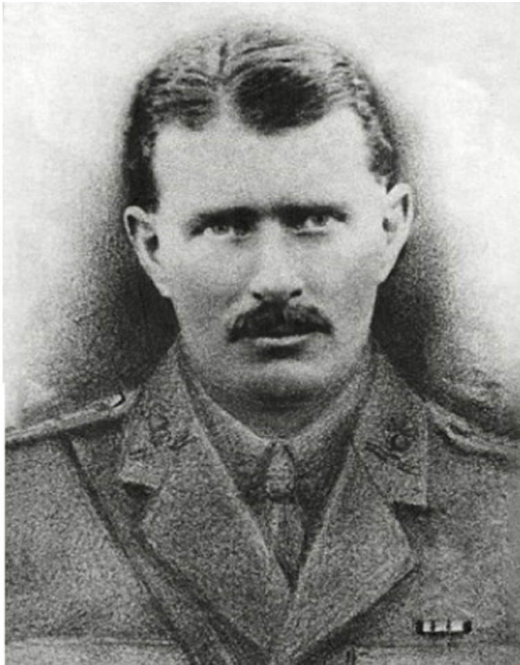
Figure 1: Cuthbert Bromley VC