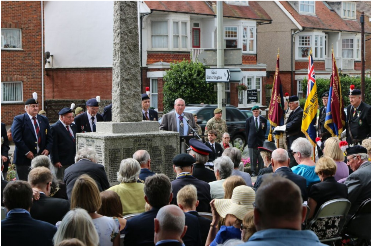
Figure 7: Cuthbert Bromley VC Paving Stone Ceremony - Seaford 16/08/2015