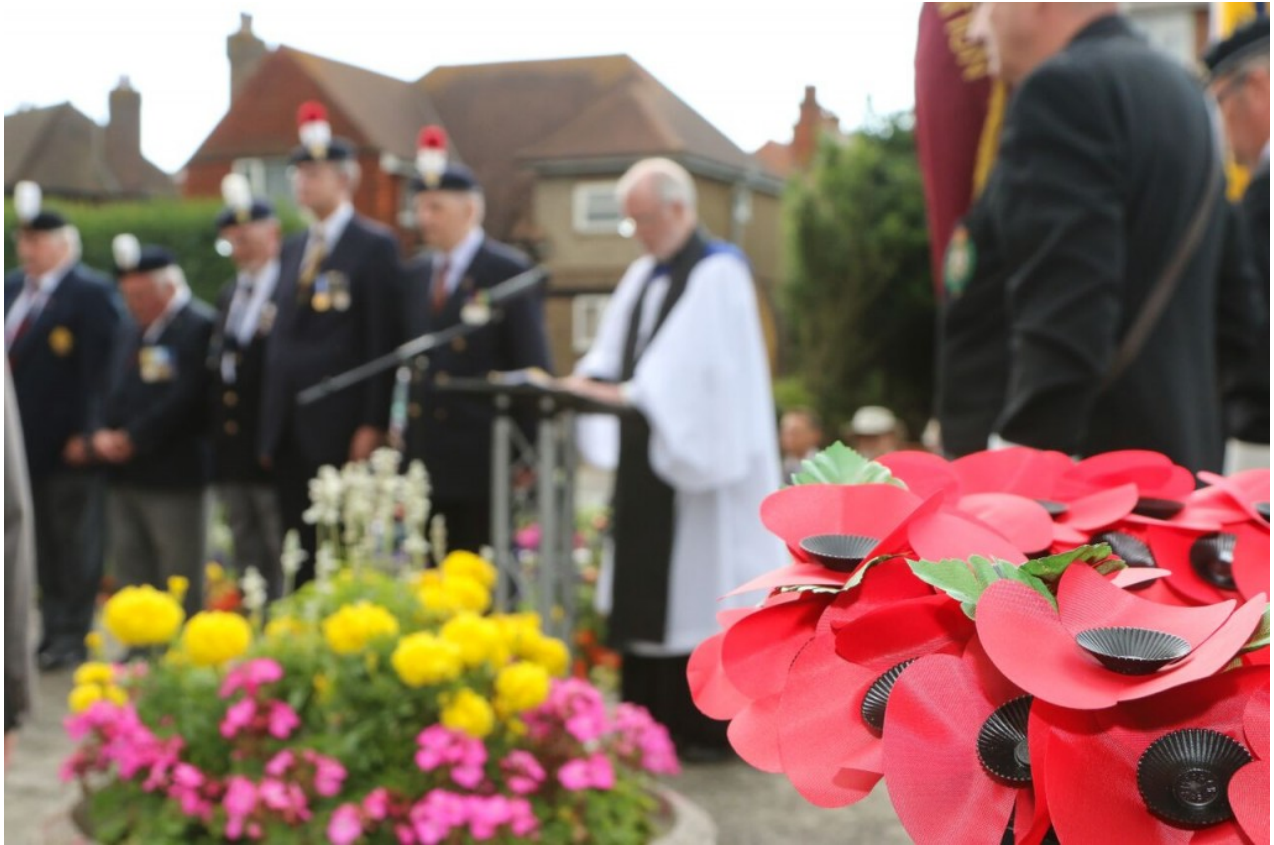
Figure 8: Cuthbert Bromley VC Paving Stone Ceremony - Seaford 16/08/2015