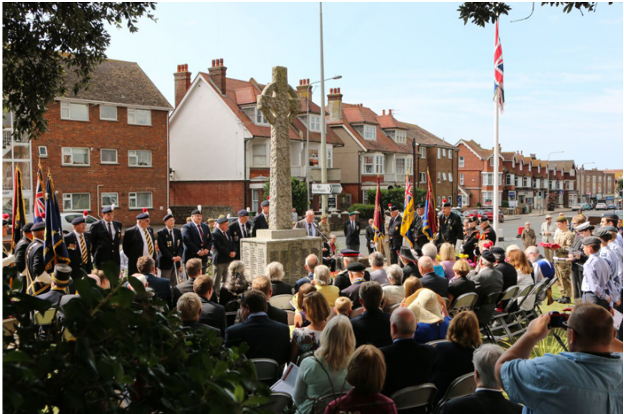
Figure 5: Cuthbert Bromley VC Paving Stone Ceremony - Seaford 16/08/2015