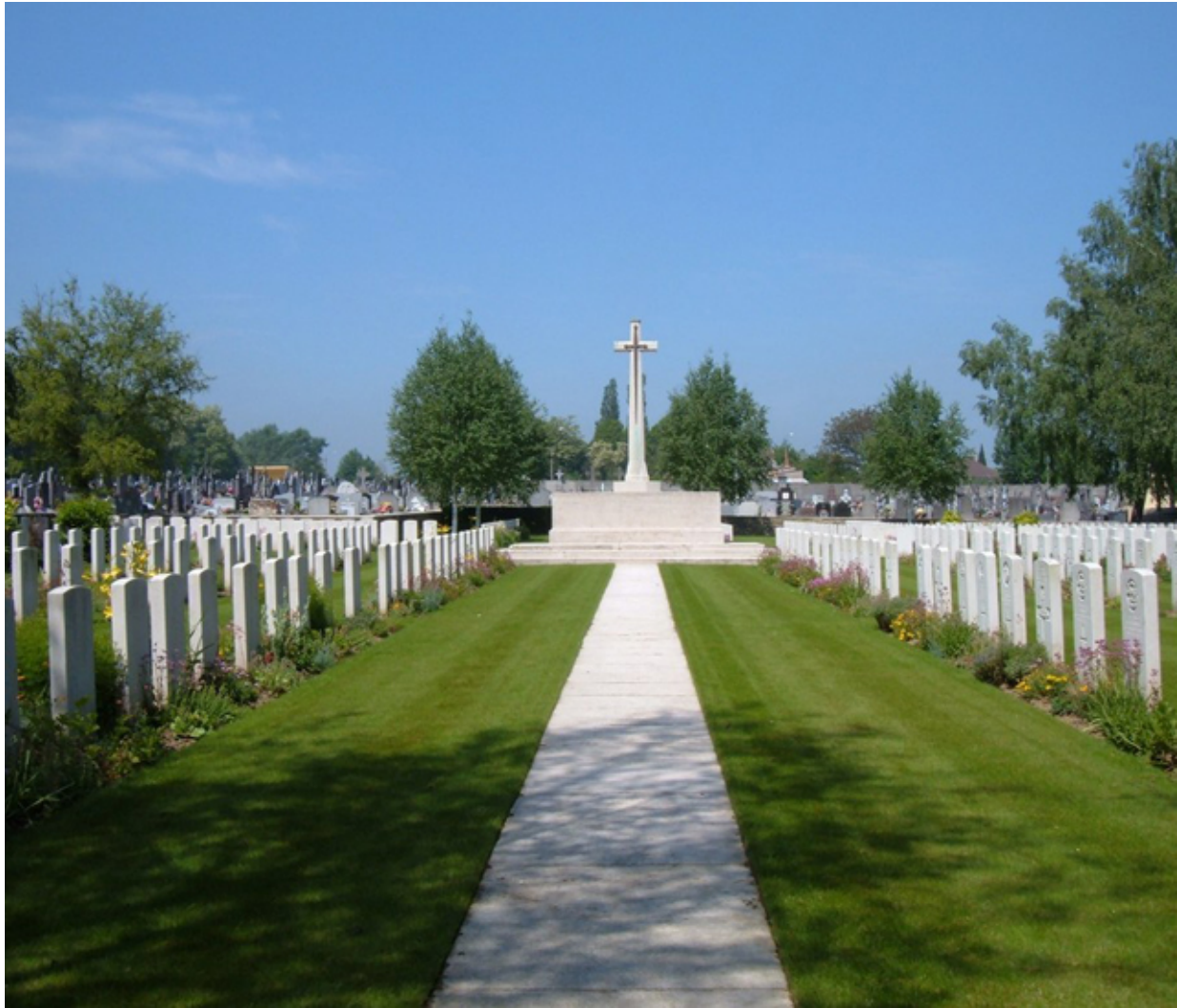
Figure 3: Bully-Grenay Communal Cemetery, British extension - © Commonwealth War Graves Commission, where Major Martineau is commemorated. © Commonwealth War Graves Commission