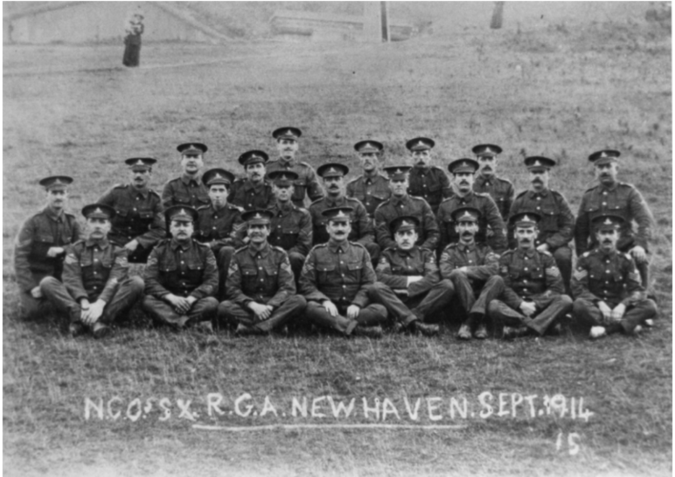
Figure 2: Sussex RGA NCOs.